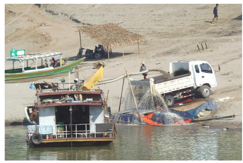
A suction dredger pumping out stone at Bagan – the lorry tailgate acting as a useful strainer

The River Ayeyarwady runs from the north down through central Myanmar (or River Irrawaddy and Burma to the British colonials) entering the Bay of Bengal in a large delta. Mandalay is about 300 miles from the sea and below Mandalay the river is very wide and shallow during the dry season. Constantly shifting sand banks mean that there can be no charts for skippers; they have to trust their judgement or use pilotage. Some channel markers exist, but these are soon out of date. Loaded vessels frequently get stuck on sand banks. In times of higher water which can be as much as a 30 feet rise after the monsoon, other hazards are created such as high sand banks now shallowly covered up. In the 19<sup>th</sup> century, sometimes steamers were stranded for seasons. Small pilot boats with un-silenced single cylinder Chinese diesel engines hired by the captains dart back and forth and across shafting to find the greatest depth. Most bulk freight is carried at deck level on pans, pushed by a tug strapped to the starboard side stern. Many pans have ramps on the stern for access by loaders, or people. At low water levels much freight cannot reach Mandalay and has to wait for the rains. Around 300 tonnes is the most that can be carried on the larger pans.