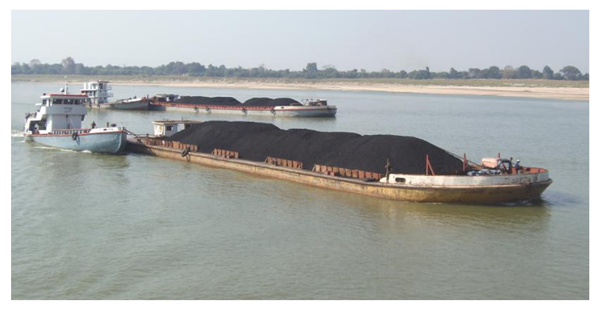
The coal pan in the foreground got free with the surge from being passed; the pan behind remained stuck (R Horne)

Cargoes include coal and oil upstream, sand and stone downstream in the main, also bamboo, grass or reeds where needed. Covered over cargoes are mainly rice upstream grown in the delta area, beans peanuts and cement downstream from north of