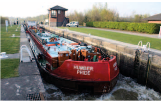
A John Whitaker tanker making its second journey to the Fleet (near Leeds) oil delivery. Rix petroleum stopped deliveries to Fleet in March this year and Whitakers have taken up the contract, making two trips a week.

The CBOA believe that this advice is correct but cannot be held responsible for any errors or omissions.