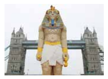
Who carried this Pharaoh up the Thames? See centre spread profile.