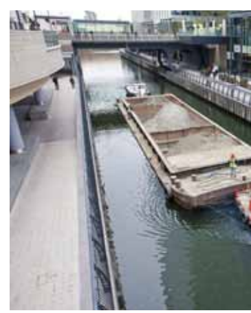
Crossrail's first load from Canary Wharf

The mayor and Central Government have been very clear that Crossrail must do all they can to limit their impact in terms of lorry movements. Excavated material from tunneling will be removed by rail and water, while construction material from stations and station-related work such as permanent access as