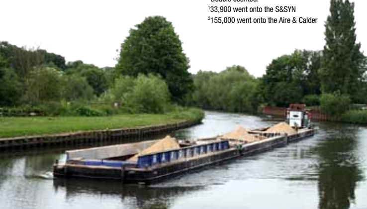
Carrying limestone, photo courtesy Malcolm Slater