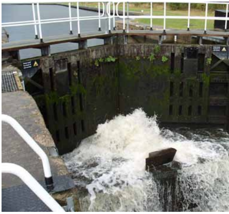
The blown cill at Lemonroyd lock with all the sluices and gates fully closed!

Please help promote CBOA and let David Lowe know how many you need, by e-mail or telephone (see contact details back page).