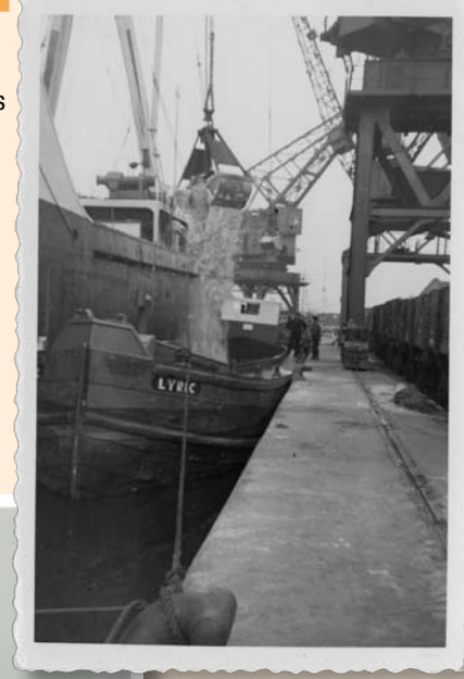
Left: 1893 - the first screw steamer built in Branford's yard Above: 1963 - loading silica sand for Knottingley glass works Below: 2007, Grimsby dock