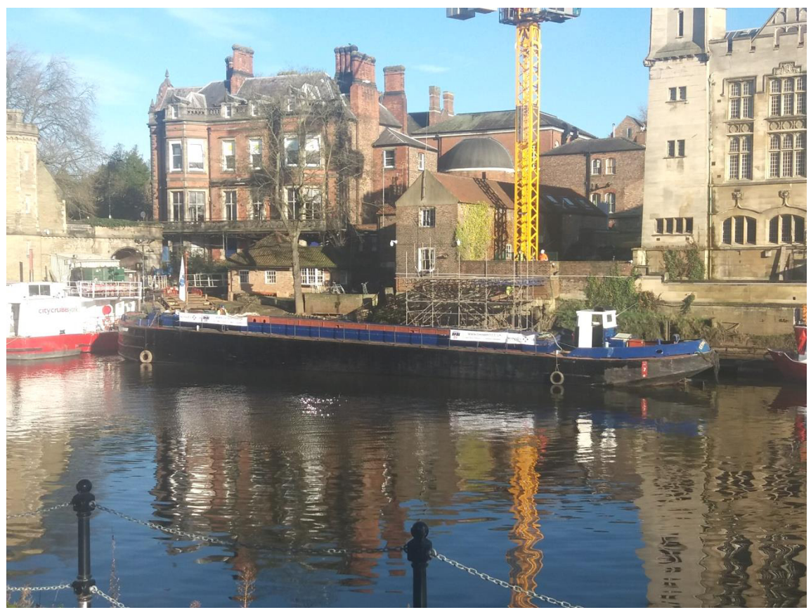
The barge George Dyson at the Guildhall, York (A. Horn)

The site does not have any suitable road frontage so the river is essential for transportation during the reconstruction. A large tower crane was floated in to handle the transfer of materials to and from the barge. The amount of material is estimated to be seven barge loads altogether, taking numerous lorry movements away from the road network, had road transport been the method used and possible. The spoil removal phase was estimated to take 6 weeks, but some flooding on the river has delayed the project slightly. More on the George Dyson on page 3.